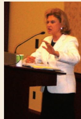
Rep. Carolyn Maloney (D-NY)