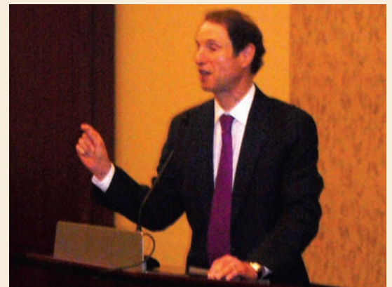
Sen. Ron Wyden (D-OREGON)