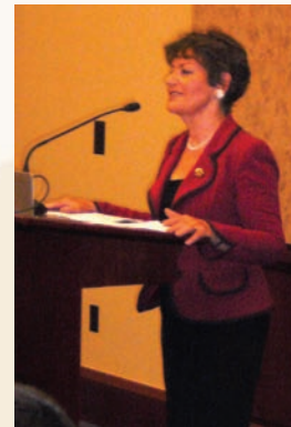
Rep. Suzanne Kosmas (D-FLA.)